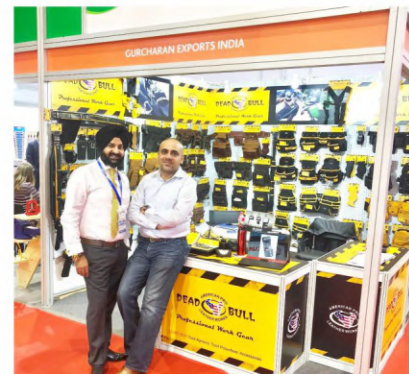
2018 China Intl. H/W Show Shanghai, CHINA