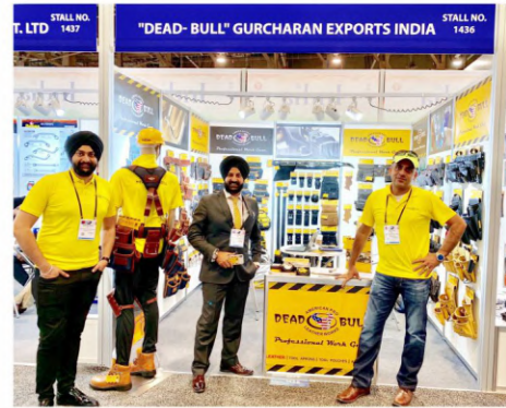
2019 National Hardware Show Las Vegas, USA