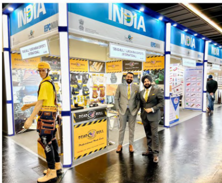
2022 International Hardware Fair Koelnmesse, GERMANY