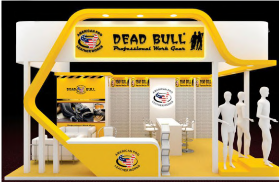
2023 International Hardware Fair New Delhi, INDIA