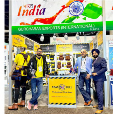
2023 National Hardware Show Las Vegas, USA