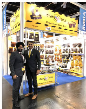
2018 Intl. Hardware Fair Koelnmesse, GERMANY